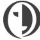
National Institute of Dental and Craniofacial Research